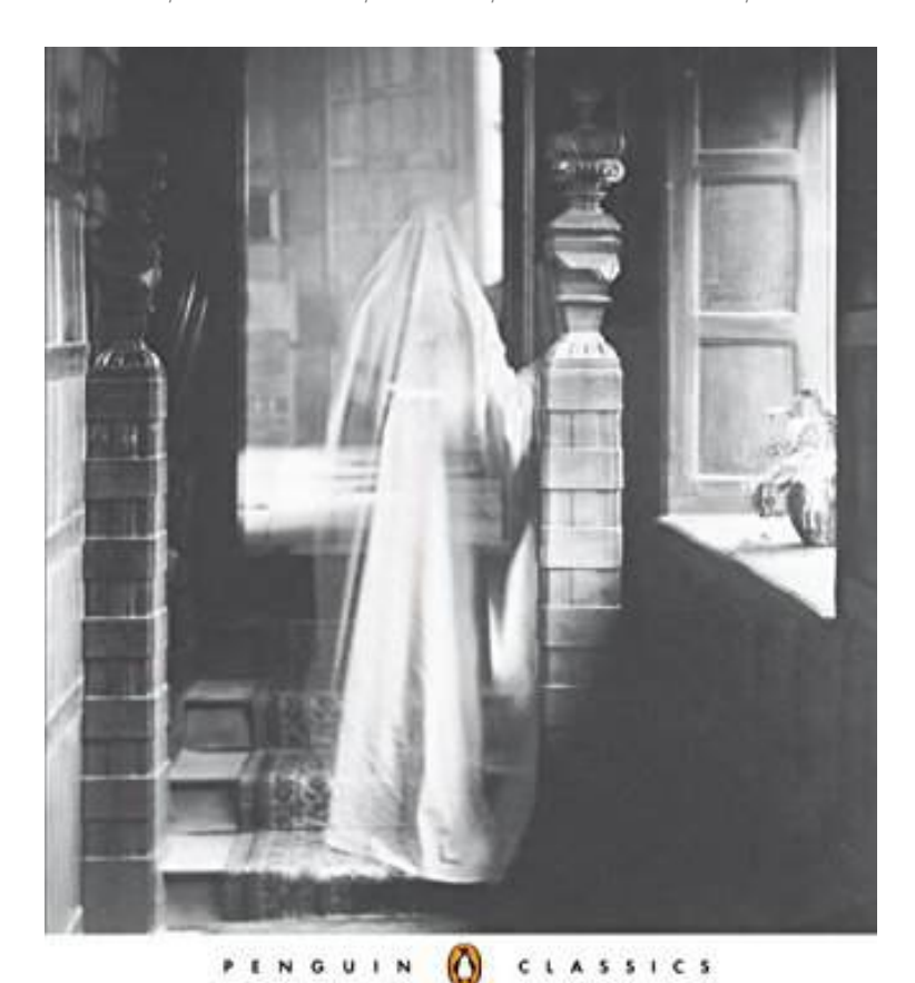
By Various DOC | *audiobook | ebooks | Download PDF | ePub